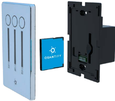
Figure 1 - Device - 3 channel dimmer fascia included