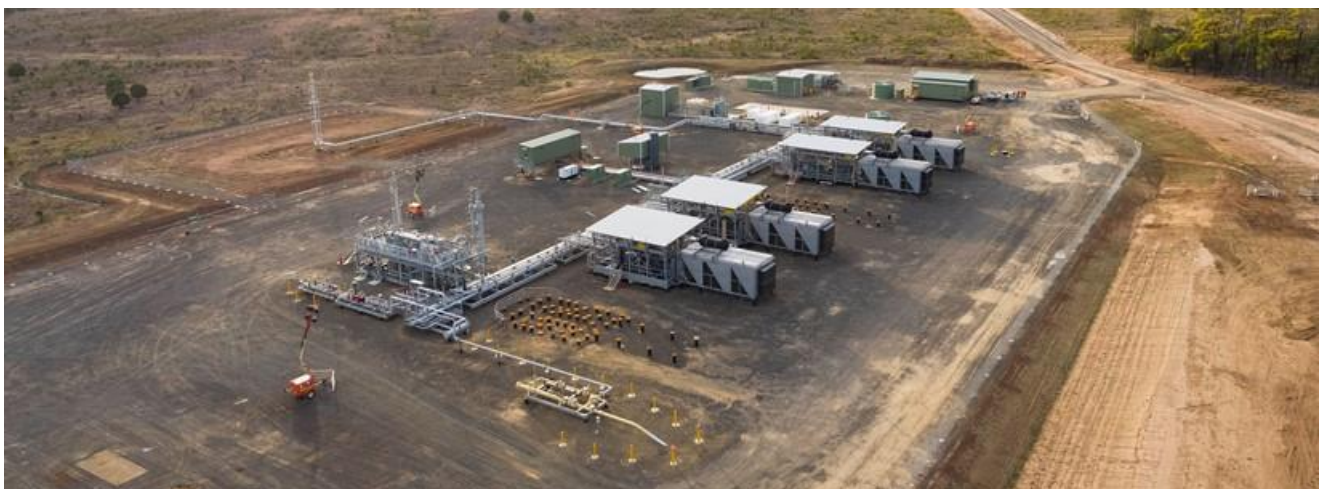
Roma North gas processing facility: Initial capacity of 6 PJ/year (16 TJ/day) with provision for low cost expansion to 9 PJ/year (24 TJ/day) at Senex's option and further expansion potential up to the designed site capacity of 18 PJ/year (48 TJ/day)

Senex and its partners continue to meet all development milestones for the Roma North and Project Atlas work programs. These will deliver a Surat Basin gas production rate of 18 PJ/year by the end of FY21, with low cost expansion options.