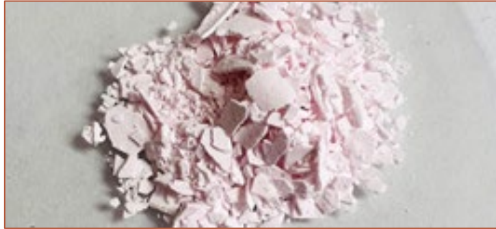
Figure 5: Jupiter's >99.9% pure sample of High Purity Manganese Sulphate

Jupiter successfully produced a >99.9% pure sample of HPMSM, or battery grade manganese, with existing Tshipi manganese ore and utilising an internally developed hydrometallurgical production process.