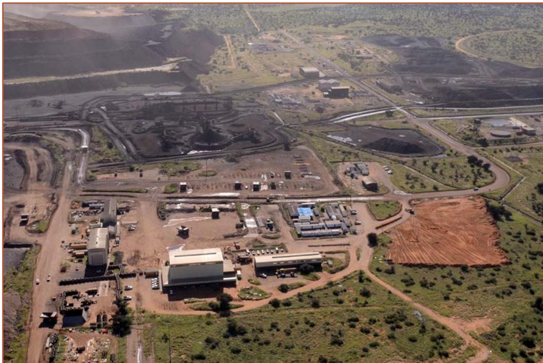
Figure 2: Tshipi Manganese Mine

Mining volumes improved compared to the prior comparative period. Tshipi commenced drilling interventions with labour availability improving also. Production volumes increased significantly during the period, with Tshipi achieving production records. Low grade production recommenced to meet requested mine gate sales as well as to take advantage of increased rail availability. Healthy stockpiles remained at the end of December 2023.