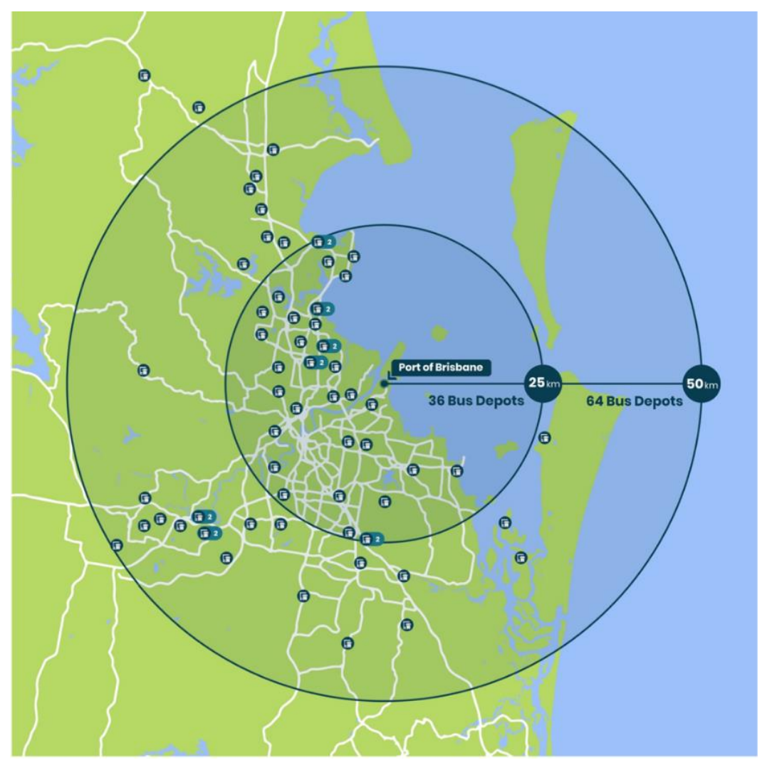
Figure 3 The Howard Smith Drive location at the Port of Brisbane is well positioned to service Brisbane's metropolitan public bus services

Our installation will also allow many other businesses to confidently trial various types of hydrogen vehicles soon, such as cement agitators, garbage trucks, and all other heavy vehicles for which battery technology is inadequate. Lion is also well placed to supply hydrogen to the burgeoning fuel cell genset market."