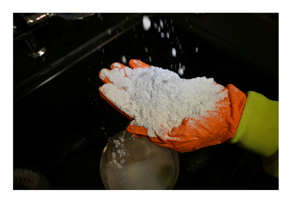
Figure 1: Boric Acid from 5E's Boron America Complex – April 25, 2024

With the first production batch of boric acid now achieved, 5E will continue to refine operating parameters to meet and exceed customer specifications. 5E anticipates beginning the customer qualification process with a variety of customer prospects. The customer qualification process will include 5E providing samples of boric acid for customers to validate their customer-established qualification criteria. Upon successful feedback from customers that the product meets their specifications, 5E will then deliver larger volumes of boric acid from the SSF, to the customer production facilities for product validation.