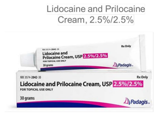
Figure 1: Acrux's revenue generating products

Following the launch of Dapsone 5%, Gel, in early Q4 FY24, Acrux now has four marketed products of which three currently generate revenue for the Group, namely Lidocaine and Prilocaine Cream, USP 2.5%/2.5%. Evamist<sup>®</sup> and Dapsone Gel, 5% as launched by our licensee in April 2024.