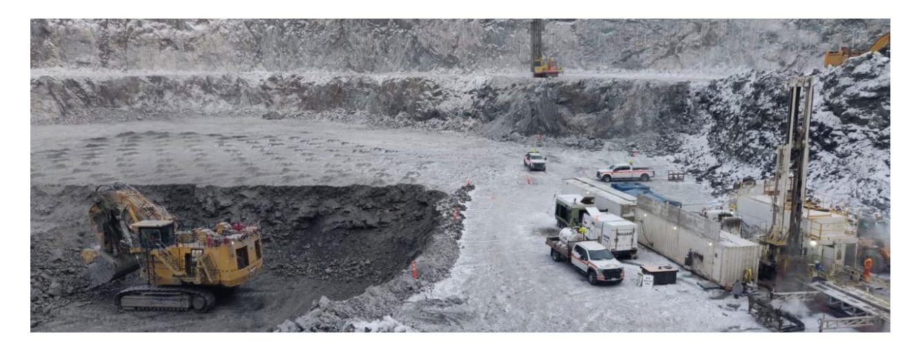
Figure 3 - Sable open pit operation (left) and the completed reverse circulation drilling program (right). A similar set-up will occur next week for the commencement of the delineation and geotechnical Sable underground drill program.

This announcement was authorised for release by the board of Burgundy Diamond Mines Limited.