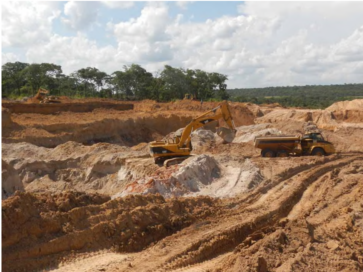
Alluvial diamond mining operations at Lulo

The Phase 1 plan involves the progressive scaling up of monthly throughput of alluvial gravels from 3,500 bcm/month in January 2015 to 10,000 bcm/month in June 2015 – at which stage and based on current assumptions, alluvial diamond mining operations are scheduled to generate positive operating cash flows.