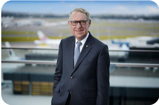
David Gonski AC