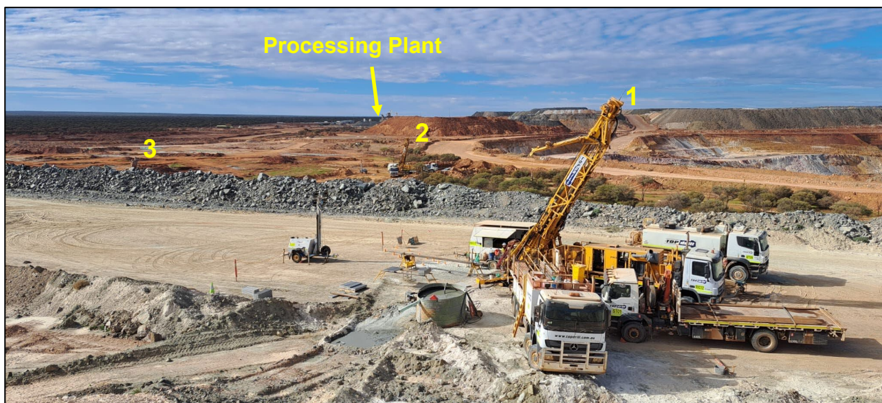
Figure 1: Three drill rigs (two diamond rigs – #1 & #2 and 1 RC rig – #3) drilling out the high-grade Never Never Gold Deposit with the 2.5Mtpa Dalgaranga Process Plant in the background.

Gascoyne Resources Limited (“ Gascoyne ” or “ Company ”) (ASX: GCY) is pleased to report metallurgical testwork results for the high-grade Never Never Gold Deposit at its 100%-owned Dalgaranga Gold Project in Western Australia.