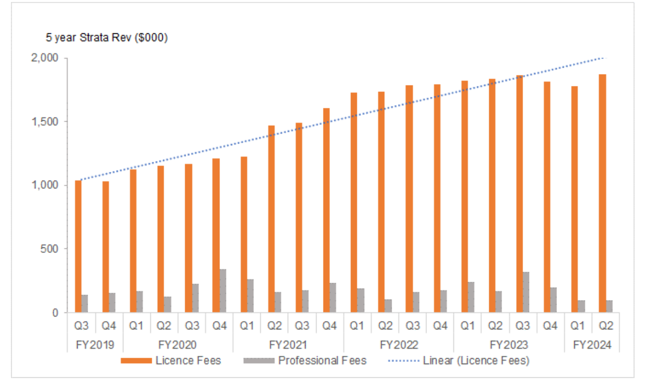
Chart 2: Q2 FY2024 delivers record licence revenue despite temporary reduction in licence requirements from large APAC customer ($000s)