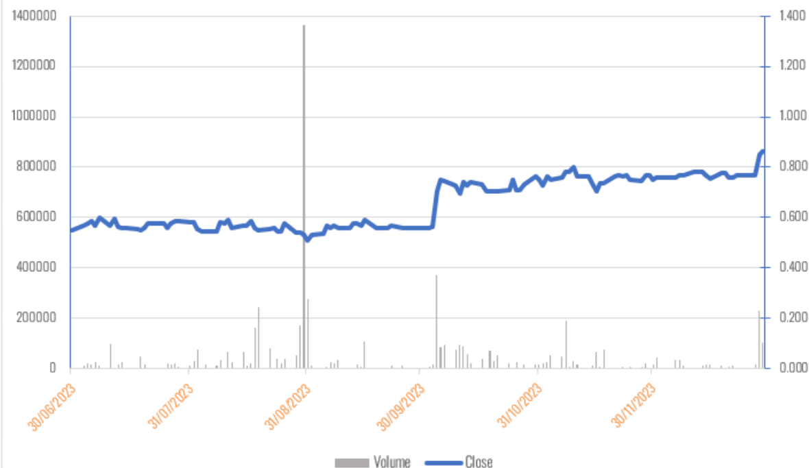
ADA Price / Volume for July 1, 2023 - December 31, 2023