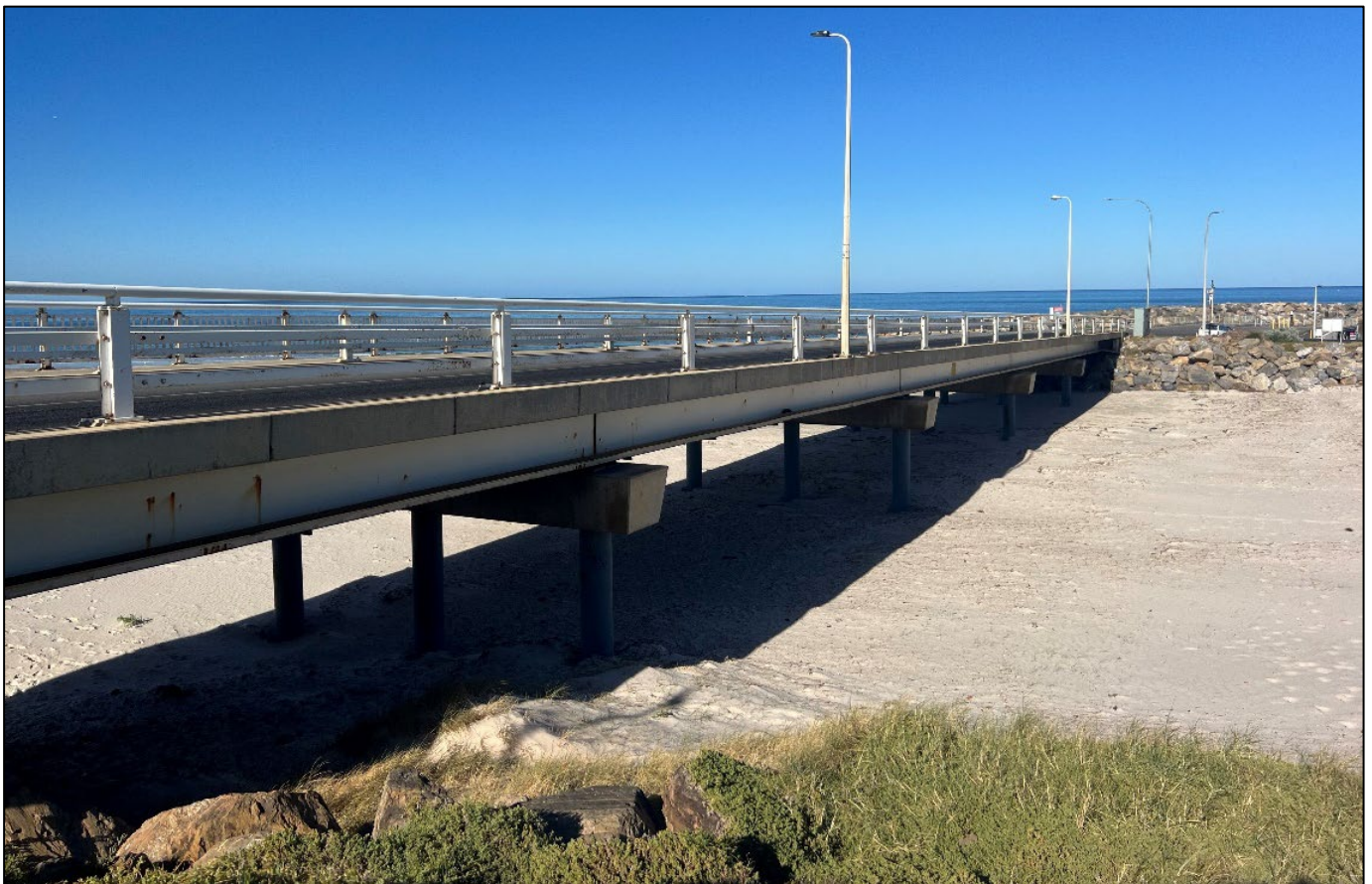
Figure 1: Trial infrastructure at West Beach Bridge, Adelaide, SA

During the trials, performance of an ecosparc ® enhanced coating will be compared with a control area coated with a market leading anti-corrosive paint. Application of the coatings in each trial will take place under the same conditions on equivalent steel structures to ensure comparability. The performance of the two coatings will be periodically assessed by an independent third-party expert according to industry inspection and testing protocols.