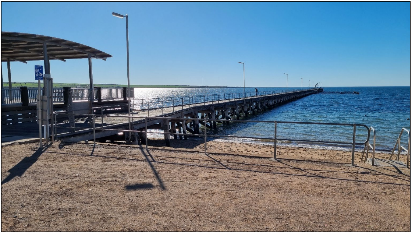
Figure 2: Trial infrastructure at Streaky Bay Jetty, Eyre Peninsula, SA

The primary objective of the field trials is to evaluate the application and performance of an ecosparc ® enhanced coating under real-world conditions. Sparc has noted the strong demand for field trials of ecosparc ® from asset owners as evidence that there is a market demand for better performing anti-corrosive coatings. Results from the independent life cycle assessment completed in Q3 2023 (see ASX Announcement 12 September 2023 ) indicated that ecosparc ® enhanced coatings can reduce the CO 2 emissions and costs associated with the maintenance of steel assets by 18 - 21% 1 and 19 - 23% 1 respectively, when benchmarked against the same non-enhanced epoxy based protective coatings. 2 Sparc believes that successful field trials will encourage market demand for ecosparc ® enhanced coatings from large steel infrastructure owners on a commercial basis.