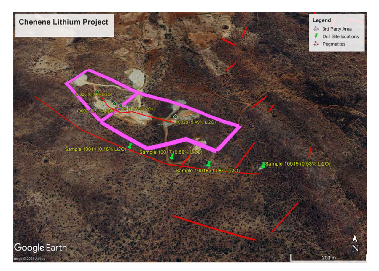
Figure 1: The initial four targets to be drilled with pegmatite rock chip assays up to 1.08% Li<sub>2</sub>O<sup>1</sup>.

The drilling program will be for an initial 8 holes targeting four prime exploration targets which have identified, with pegmatite rock chips assayed upto 1.08% Li<sub>2</sub>O in Target 1<sup>1</sup>. Based on visuals of the core and assay results, there is the opportunity to expand the program by continuing holes to a greater depth and also to increase the total number of holes to be drilled.