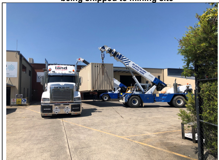
IMAGE 1: De.mem containerized membrane-based water treatment plant being shipped to mining site

In late CY 2022, De.mem announced a new contract for the supply of a containerized, membrane-based water treatment plant to a subsidiary of South 32 Limited ("South 32", ASX: S32, market capitalization ~$15 billion), which was ultimately valued at $1.6m. In late March 2024 the Company completed the project, with the plant installed on site and being fully operational. With corresponding project costs almost entirely being paid for prior to 31 March 2024, De.mem had a balance of $1.1m in outstanding customer payments from this and another industrial project as of 31 March 2024. Thereof, approximately $800k have already been received as at the date of this report.