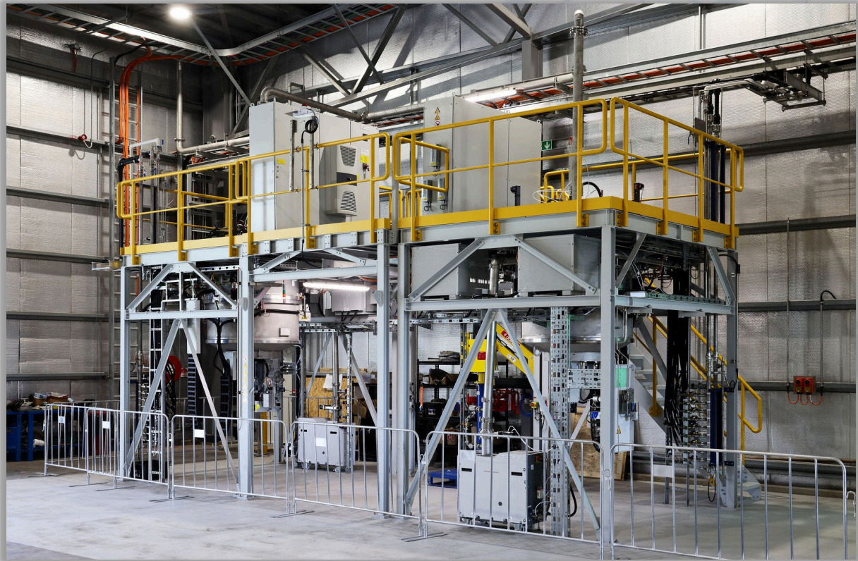
First 2 (Phase A) sapphire growth units – fully installed

The initial 2 (Phase A) sapphire growth units have now been fully installed, with the on-site assistance of Ebner-Fametec technical personnel.