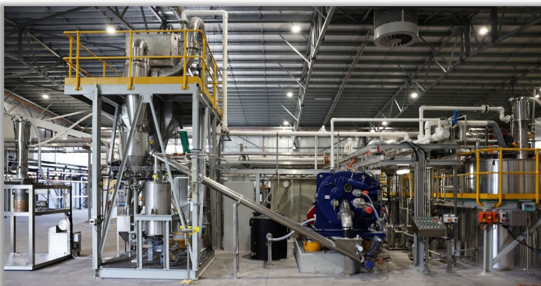
Installed aluminium sulphate circuit, showing flash dryer (LHS) and centrifuge (centre)

The high purity alumina hydroxide circuit is undergoing commissioning, and is now producing both high purity boehmite (Al-O-OH) and high-purity ATH.